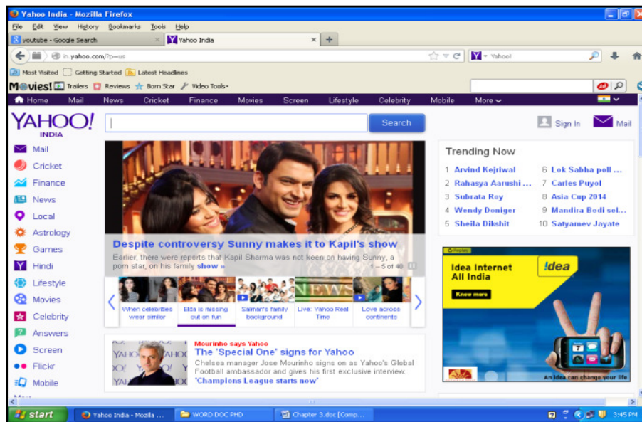
Figure 2: Print screen of Yahoo.com homepage