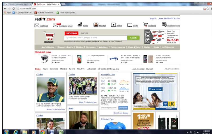
Figure 3: Print Screen of Rediff.com homepage

As far the aesthetics are concerned, the website follows the Power grid pattern of layout with only one main advertisement on the homepage. In comparison to other informational sites, Rediff provides the ecommerce platform, thus promoting the online trade as well.